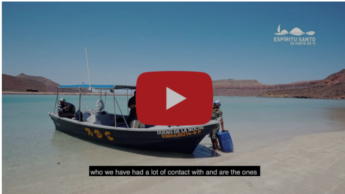
ROC doubles vigilance during Covid closures