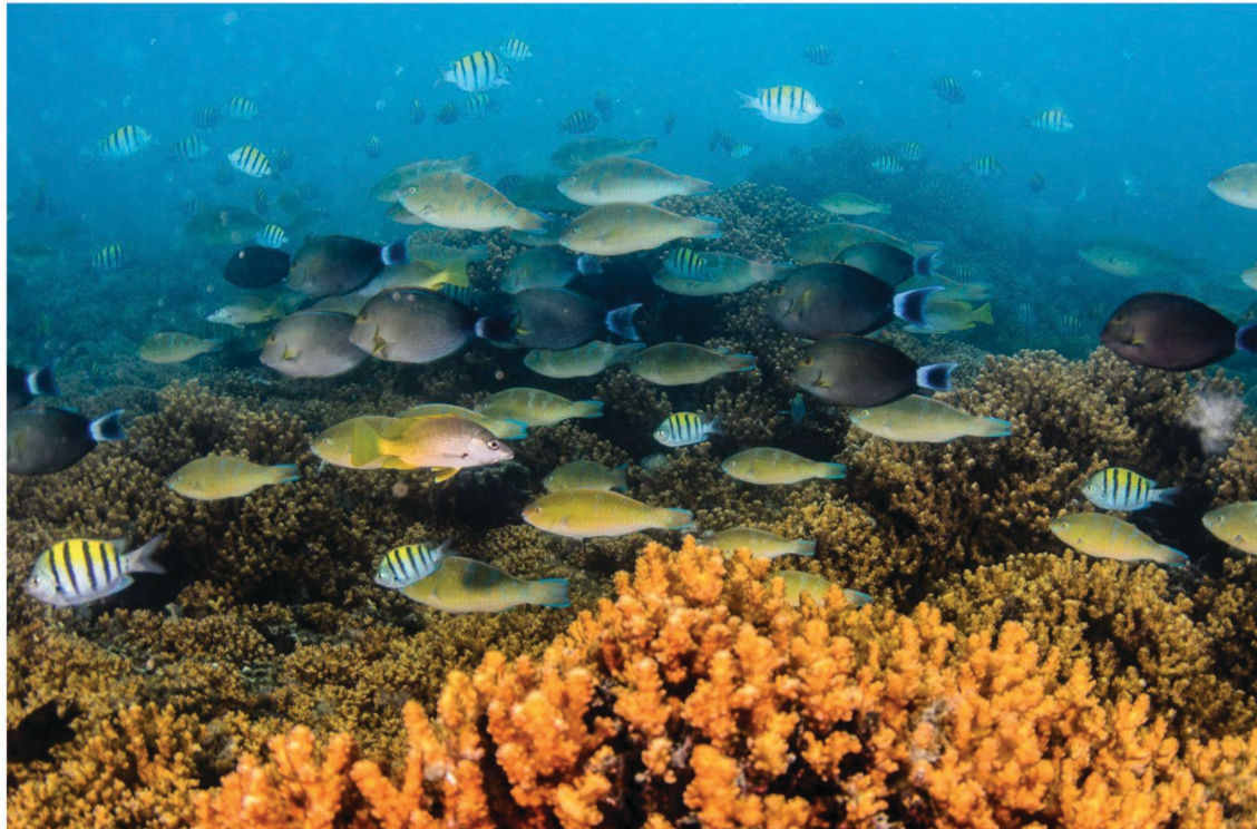
The recovery at Espiritu Santo National Park - The most beautiful island in all the Sea

Formed in 1993, SeaWatch is confronting the rapidly declining fish populations in the Sea of Cortez.